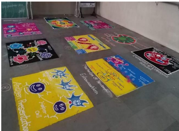
Poster of the competition and different rangolis drawing in the competition

IMMUNOLOGY RANGOLI COMPETITION JOINTLY ORGANIZED BY- DEPARTMENT OF MICROBIOLOGY H. V. DESAI COLLEGE, PUNE AND MICROBIOLOGISTS SOCIETY INDIA. DATE: 31 AUGUST 201 TIME: 10AM – 11AM VENUE: OFFICE FLOOR